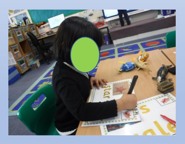
We've been Reading the Rainbow Fish story and learning about sharing and being kind to our friends. We made friendship bracelets to give to our friends.