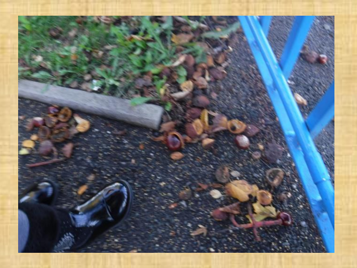
September/ October 2021